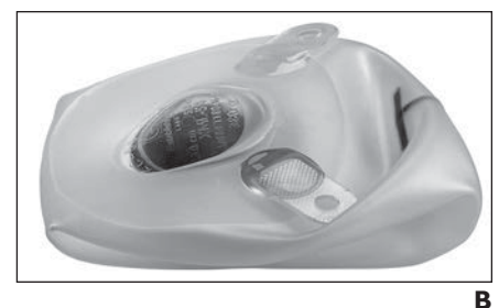
Fig. 1—Photographs of tissue expander with radiofrequency identification (RFID) port that underwent MRI testing. A and B, Top (A) and side and bottom (B) views show tissue expander with RFID port.

(i.e., 1.32 g/L NaCl and 10 g/L polyacrylic acid in distilled water) that was prepared to simulate human tissue [15–19, 22]. The tissue expander with RFID port was positioned in the gelled saline–filled phantom to yield the worst-case temperature rise for the experimental conditions used in this investigation (i.e., at a position with a high uniform electric field that is tangential to the implant, ensuring an extreme radiofrequency-related heating condition for this experimental setup) [15–19].