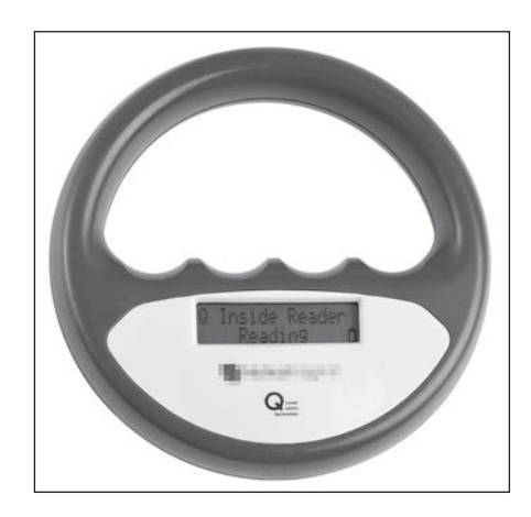
Fig. 2—Photograph shows Q Inside Reader (Establishment Labs) used to interface with radiofrequency identification of tissue expander to identify unique electronic serial number assigned to specific implant.

Temperature recordings—A fluoroptic thermometry system (Lumasens Technologies) was used to measure temperatures related to MRI for the tissue expander with RFID port [15–19]. Three thermometry probes (0.5 mm diameter, model SFF-2, Lumasens Technologies) were placed to record temperatures on the metallic component of the implant (i.e., the RFID port) as follows: probe 1, placed at one end of the RFID port; probe 2, placed at the opposite end of the RFID port; probe 3, placed at the middle portion of the RFID port. A