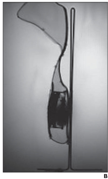
Fig. 4—MRI of tissue expander with radiofrequency identification (RFID) port. A MR image of phantom shows tissue expander with RFID port obtained using gradient-re-

A , MR image of phantom shows tissue expander with RFID port obtained using gradient-recalled echo pulse sequence in long-axis imaging plane.